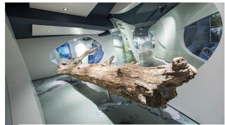
Gletscher.leben Franz-Josefs-Höhe, Großglockner ; Foto: ÖAV